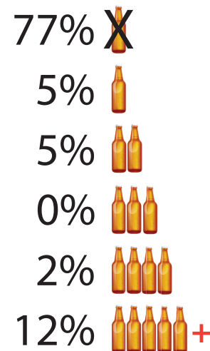
Figure 2. Pope County 11 th Graders Reporting How Much They Typically Drink at One Time (2016 MSS)

Past 30-day prescription drug misuse was reported by 4% of 8 th graders, 7% of 9 th graders, and 7% of 11 th graders in Pope County in 2016. Specifically, in the past year, students in these grades combined reported the misuse of stimulants (1.6%); ADD or ADHD medication (1.6%); pain relievers (2.7%); and tranquilizers (2.1%).