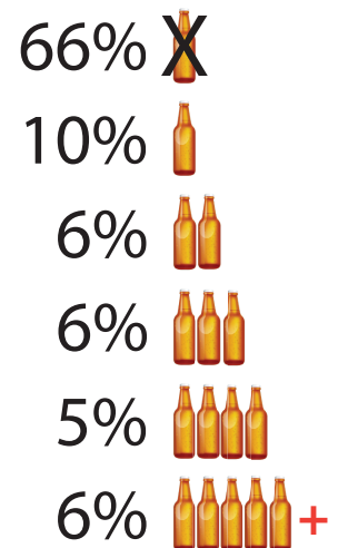
Figure 2. Wadena County 11 th Graders Reporting How Much They Typically Drink at One Time (2016 MSS)

Past 30-day prescription drug misuse was reported by 3% of 8 th graders, 3% of 9 th graders, and 6% of 11 th graders in Wadena County in 2016. Specifically, in the past year, students in these grades combined reported the misuse of stimulants (0.9%); ADD or ADHD medication (2.9%); pain relievers (3.3%); and tranquilizers (0.7%).