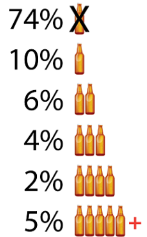
Figure 2. Asian American 11 th Graders Reporting How Much They Typically Drink at One Time (2016 MSS)

Past 30-day prescription drug misuse was reported by 2% of AA 8 th graders, 8% of AA 9 th graders, and 14% of Asian 11 th graders in 2016. Although data are not available by grade, 5% of 8 th , 9 th , and 11 th grade PI students reported prescription drug misuse, overall.